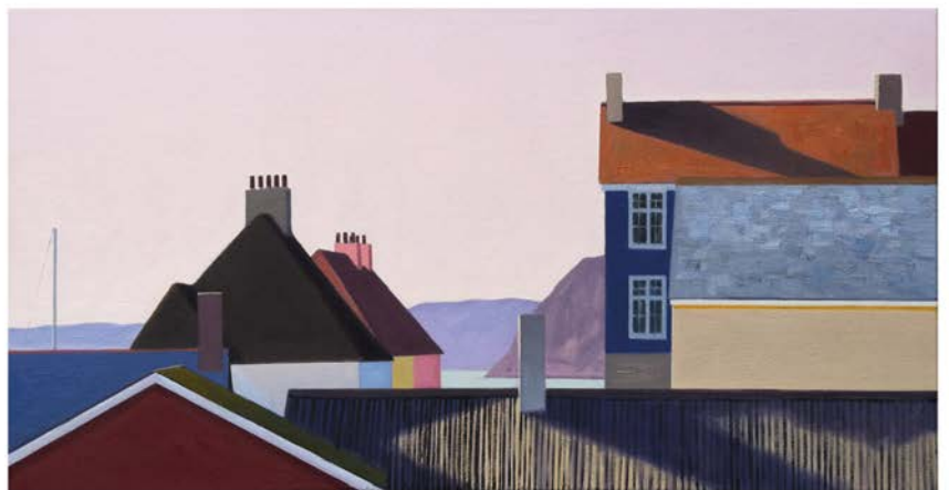
Alex Lowery West Bay 327 oil on canvas 2026 50 x 110cm

01308 459511 @sladersyard sladersyard.co.uk