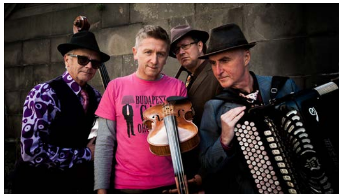
The Budapest Cafe Orchestra - a blistering barrage of czardas, East European and Russian folk tunes

There are two further south west dates later in the year—14th October at Teignmouth Pavilions and 27th November at the Exchange at Sturminster Newton.