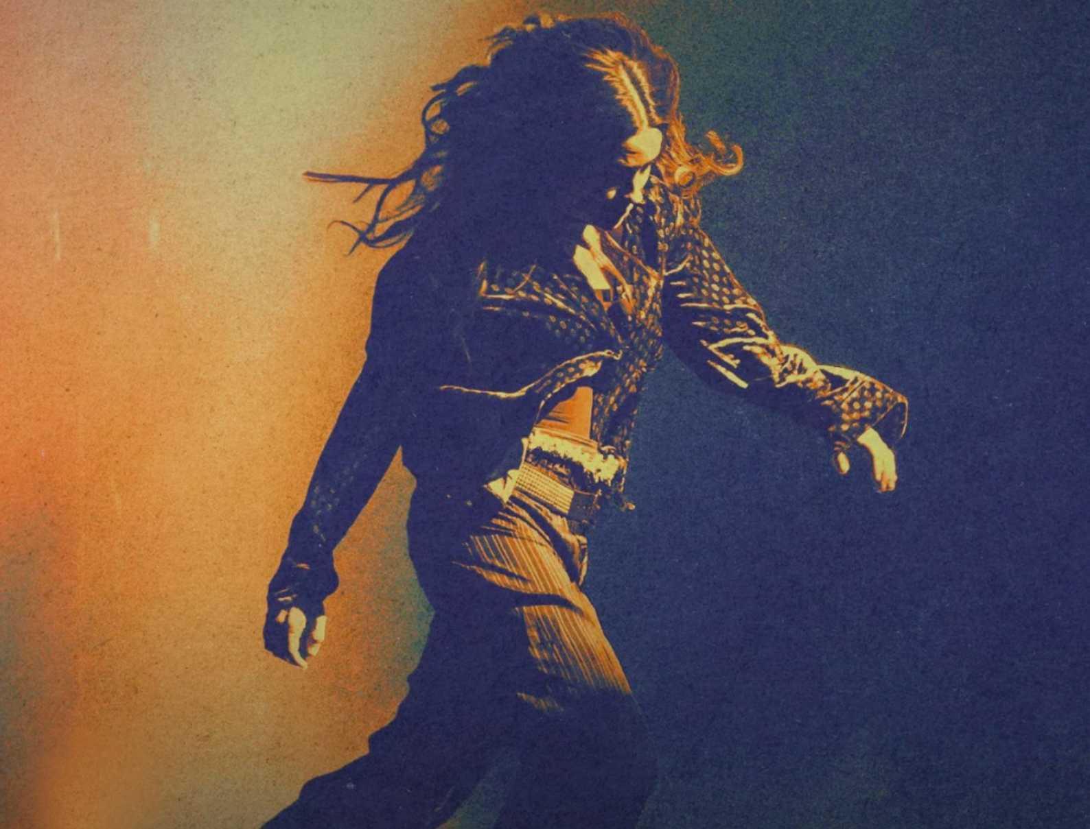
Alanis Morissette headlines at Powderham Castle along with Lewis Capaldi for an open air spectacular in June

Ensemble Augelletti are a BBC New Generation Baroque Ensemble (2023-25) and City Music Foundation Artists (2024-26). They perform regularly on BBC Radio 3's In Tune and Early Music and in arts festivals across the UK including York, London, Brighton, Beverley Early Music festivals.