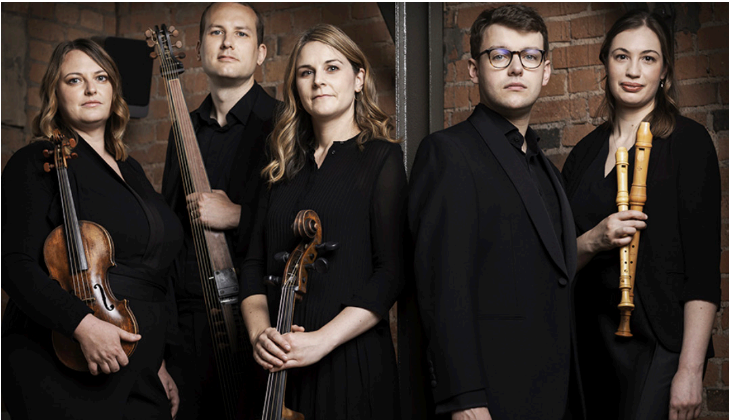
Ensemble Augelletti come to Bridport, Ilminster and Crewkerne in April

highly respected London-based session musicians have an eclectic repertoire, inspired by influences from around the world, including jazz, folk and Anglo/Caribbean grooves.