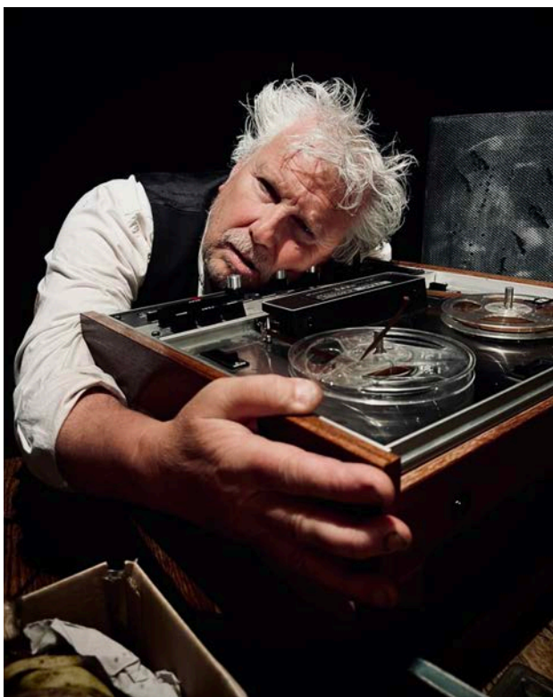
Samuel Beckett's Krapp's Last Tape comes to Dorchester in April

Other local dates on the spring tour by the company, which is based at Preston, Weymouth, are: Poole Lighthouse, 9th April 2pm, and Exeter Phoenix arts centre, 14th April, 1.30pm.