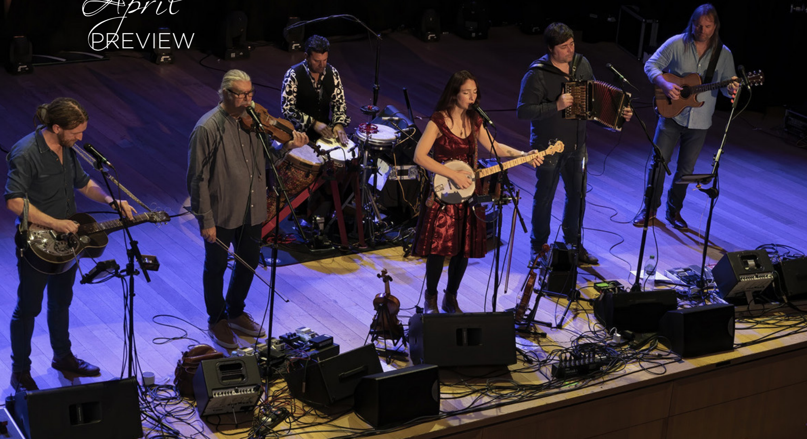
The Gigspanner Big Band take the stage at the Marine Theatre in Lyme Regis in April