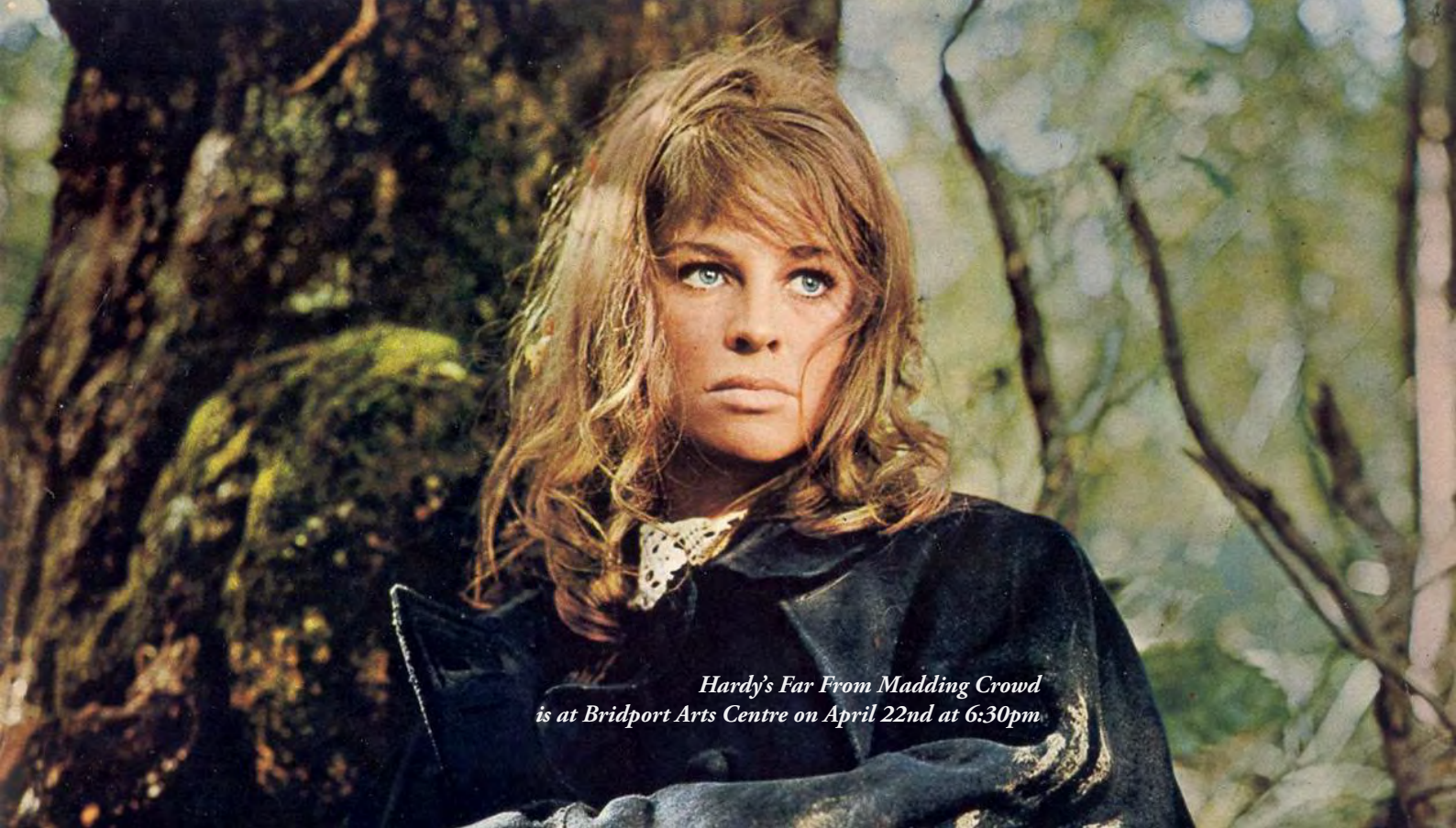
Hardy's Far From Madding Crowd is at Bridport Arts Centre on April 22nd at 6:30pm

Organisers of the festival are asking anybody involved with the filming of Far from the Madding Crowd in 1966 to get in touch come forward and attend the screening on Wednesday night.