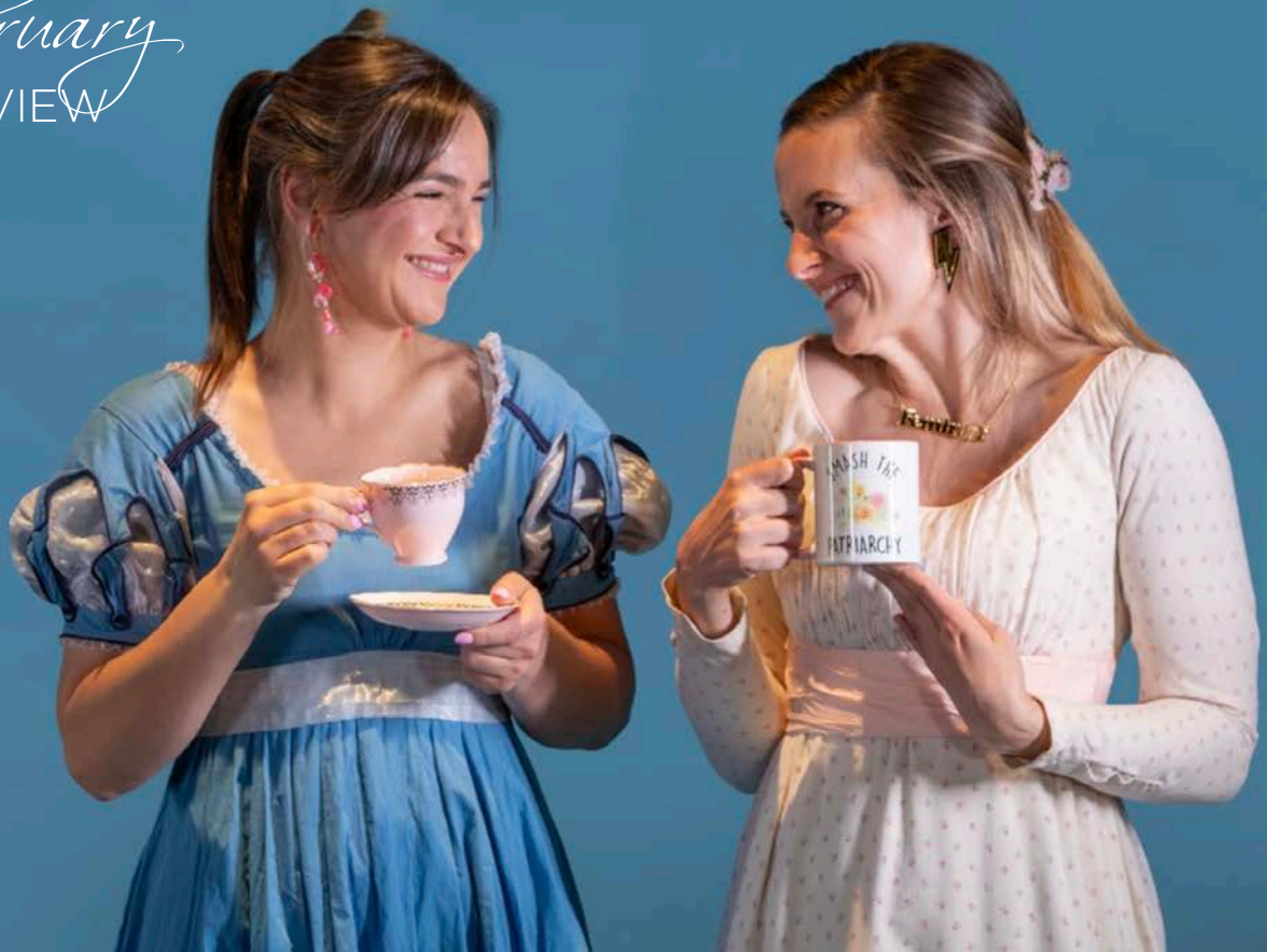
The Jane Austen Fan Club is at Bridport Arts Centre in February