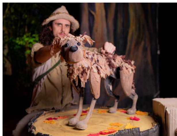
Yara in the Wild Wood comes to Cerne Abbas in February

FROM Book Witches to Viking gods and adventures in the woods, Artsreach has a host of fun and entertainment for children of all ages over the February half term, from Sunday 15th to Saturday 21st, with live music, magical puppetry and more.