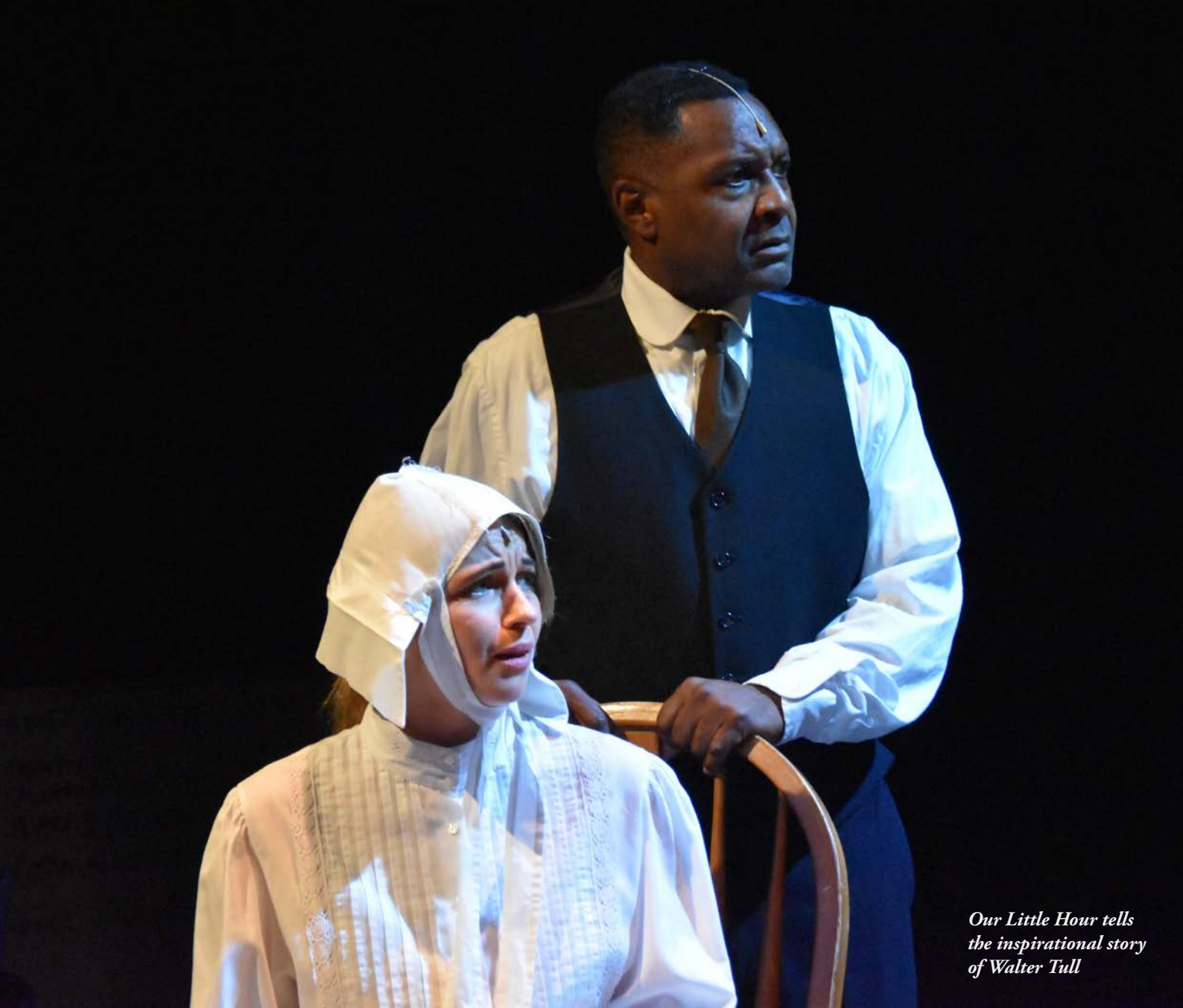
Our Little Hour tells the inspirational story of Walter Tull