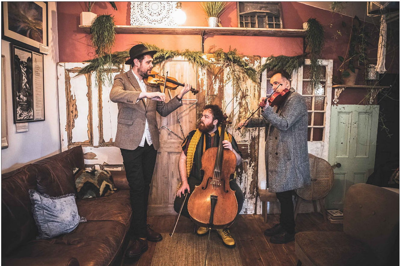
VRi sheds new light on a vibrant folk tradition in February

with a show filled with songs, sequins and drama galore, promising the audience that they will be shaken, stirred and left in stitches.