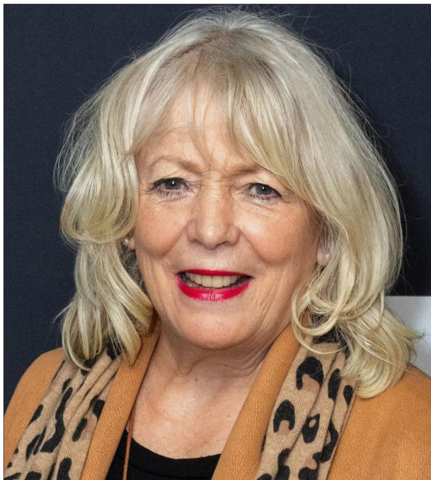
Alison Steadman is a special guest at The Lighthouse in Poole in February

LYME Regis has two major literary connections—one is Jane Austen's Persuasion and the other is John Fowles and his best-known novel, The French Lieutenant's Woman . Austen's last completed novel had an anniversary production at the Marine Theatre last year, and this year, from 11th to 14th February, the mysterious cloaked woman returns in a new play.