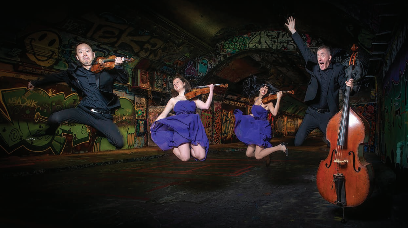
Graffiti Classics bring their hilarious musical show to Wootton Fitzpaine in January.