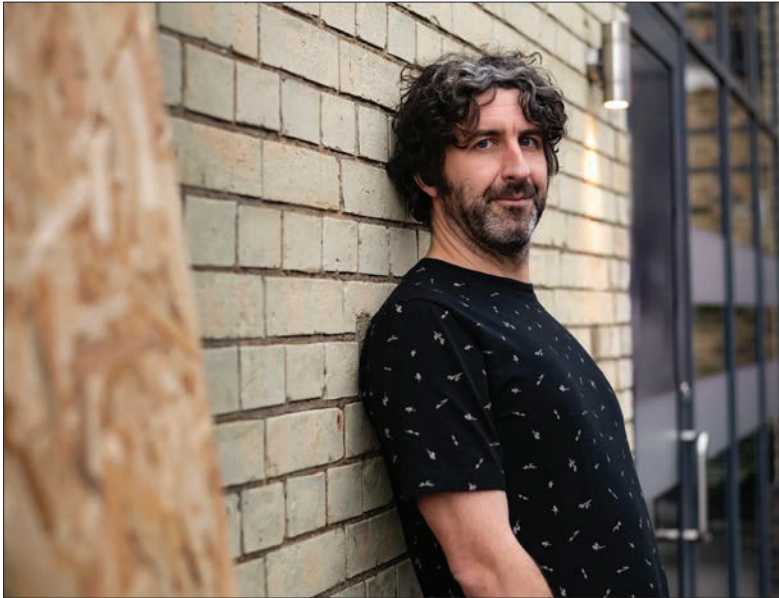
Mark Watson comes to the Electric Palace in Bridport in January

The play, produced by award-winning OffPiste Theatre, is described as a dark comedy thriller which explores themes of class, gentrification, assumption and taxi driving. It had its premiere at the Merlin Theatre in Frome in November, as part of the theatre's 50th anniversary celebrations.