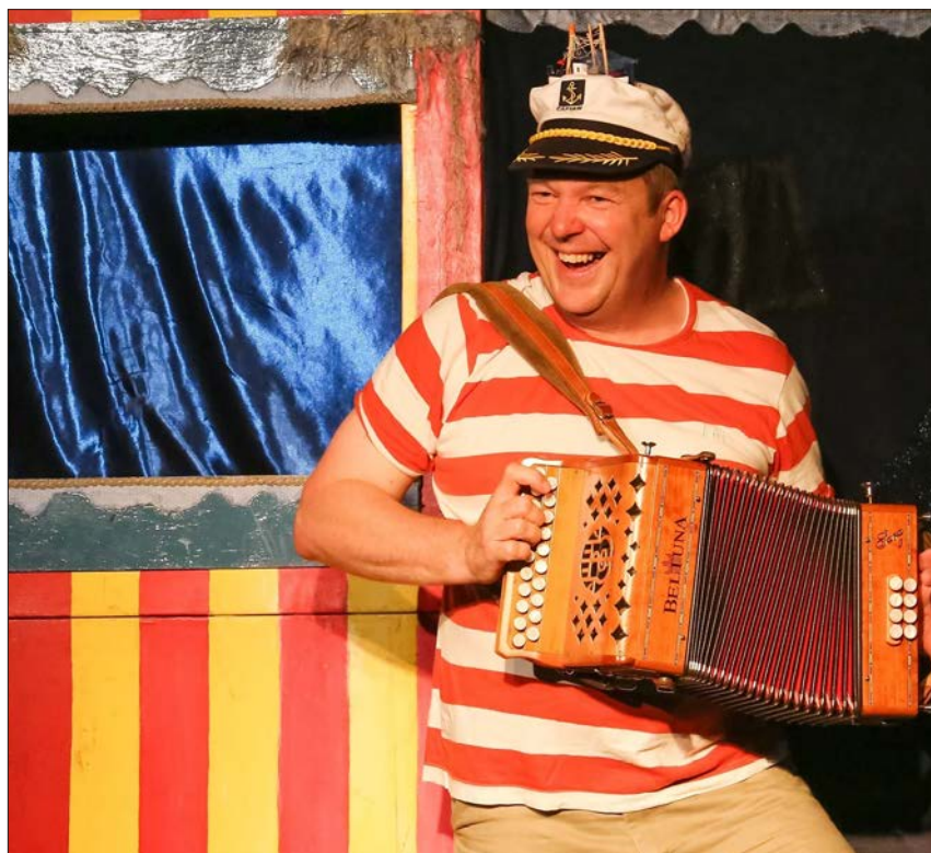
The Sea Show comes to Bridport's Millennium Green in August

Carroll, retaining all its quirky British charm, classic characters and comedic poems in a true theatrical treat for all the family.