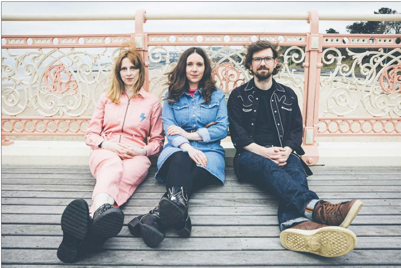
Jaywalkers come to Burton Bradstock Festival of Music and Art