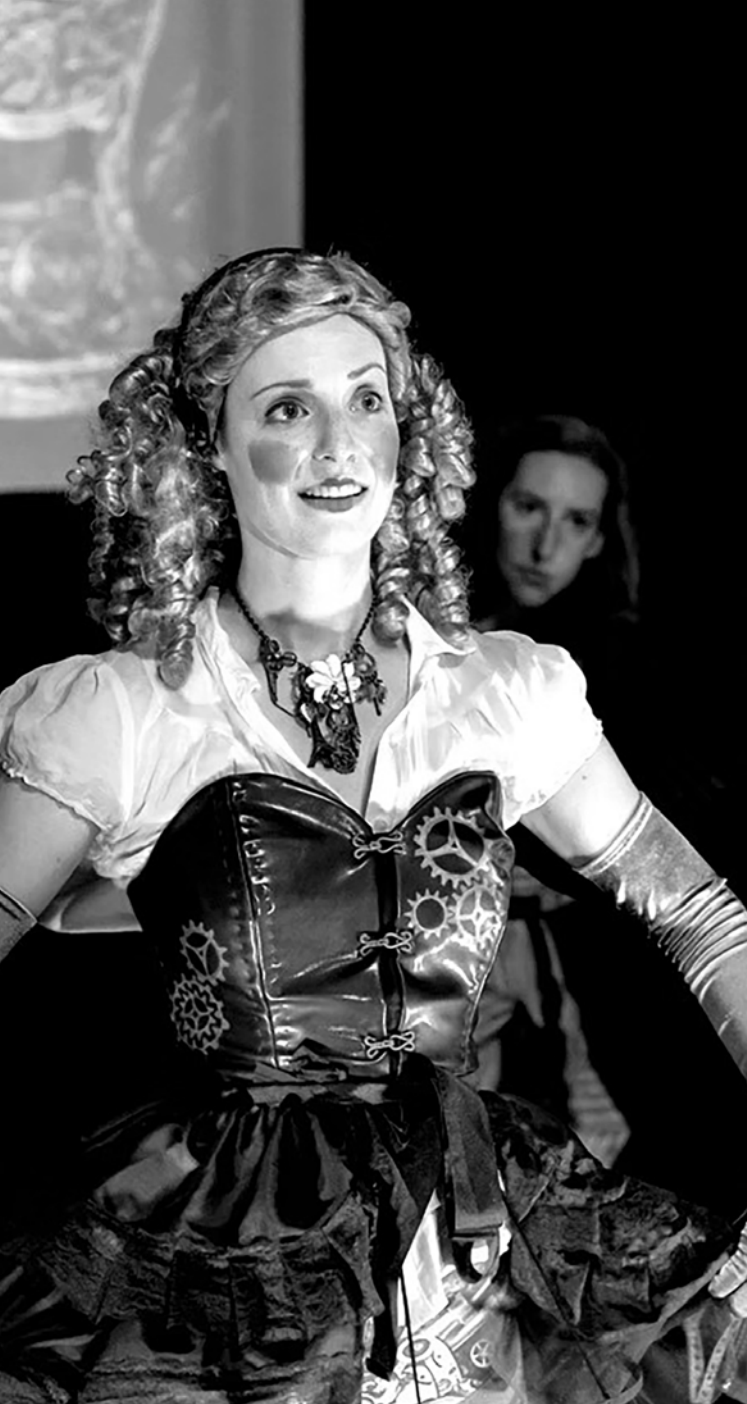
Opera comes to Osborne in August

but perfectly-formed summer festival which brings musical theatre from Puccini to silent movies to rural Dorset.