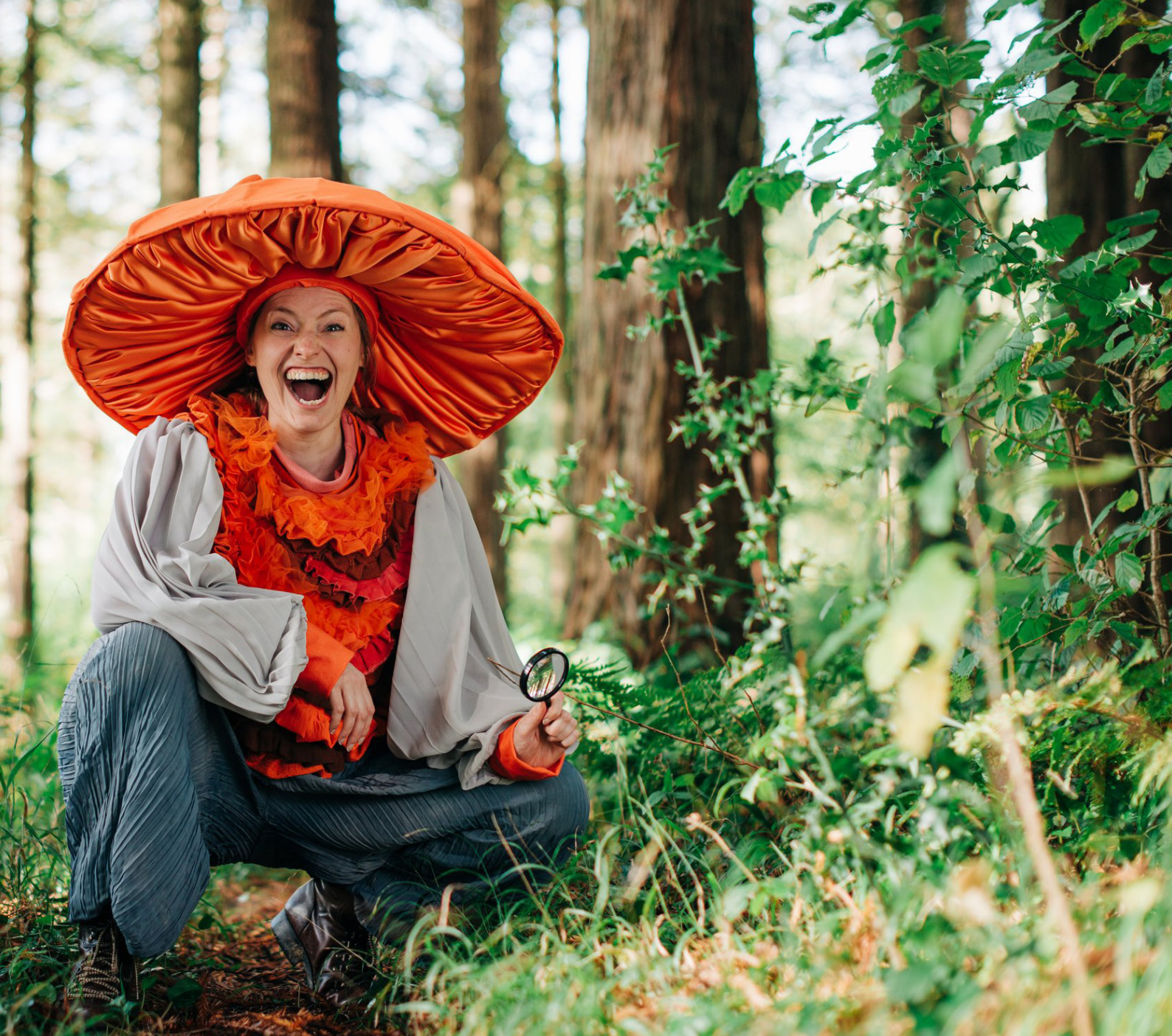
The Mushroom Show comes to Litton Cheney in August