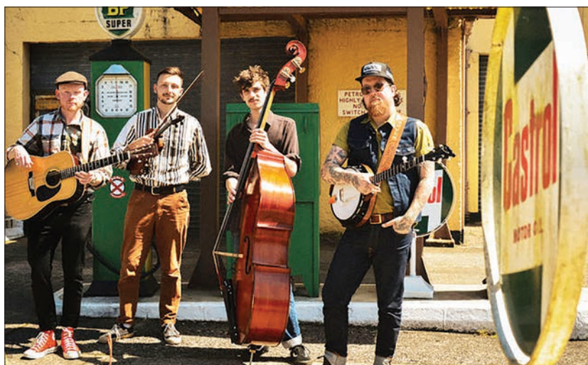
Taff Rapids coming to Melbourne St Andrew, Halstock and East Stour

IT may be a long way from the blue grass mountains of Virginia to the Welsh valleys but the five musicians of Taff Rapids have created their own musical genre—Blwgras from Wales. They have a short tour with Artsreach to village halls at Melbourne St Andrew on Wednesday 23rd August, Halstock, on Thursday 24th and East Stour on Friday 25th, all beginning at 7.30pm.