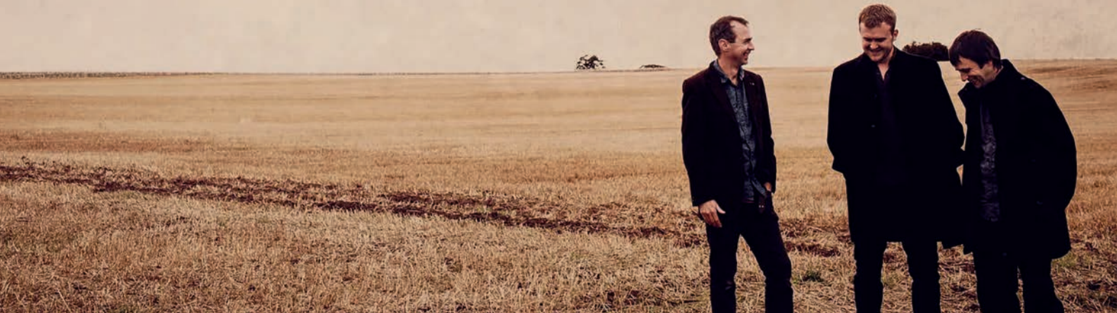
Leveret, described as three of England's finest folk musicians come to Sidmouth Folk Festival