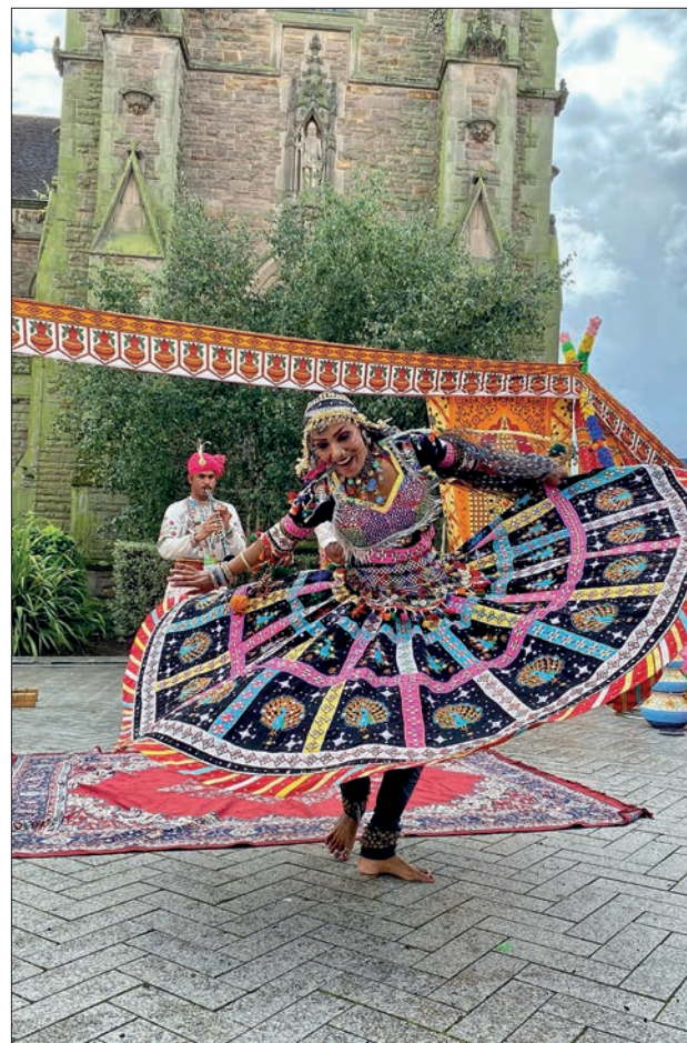
Elite street circus performers, Circus Raj, come to Bridport in July

The cast of aerialists, acrobats, musicians, slack-rope walkers, giant puppet characters and the eye-watering displays by their fakir, present a colourful,