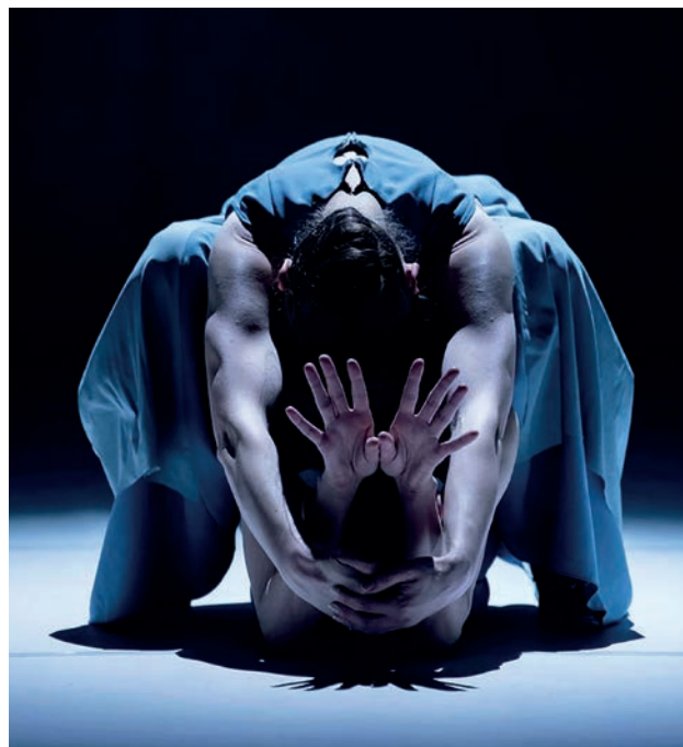
Unique approaches to flamenco in Dorchester in July

The production draws our attention to the unexpected beauty and rhythm harboured in the insect world in a visual, dynamic and electric flamenco show. Inspired by the Blue Ghost Firefly and the importance of insect conservation for the survival of our natural world, this is a nostalgic celebration that reminds us of our interconnectedness, embraces our need for transformation and shows us that even the smallest