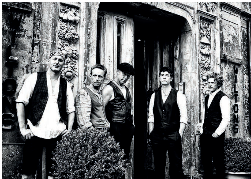
The Salts season things at the Beehive in Honiton

HONITON's Beehive Centre welcomes acclaimed folk band The Salts on Saturday 26th July for an evening of sea shanties and songs from the sea.