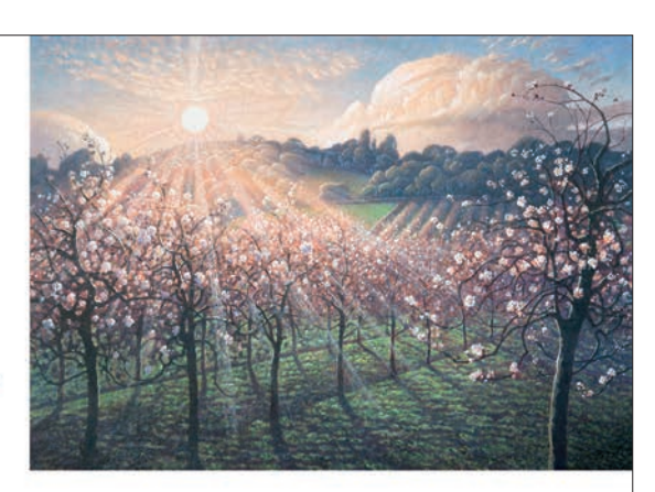
James Lynch The Orchard, Underwood egg tempera on panel 51 x 71cm framed size 64 x 83.5cm

Contemporary Art & Craft Gallery West Bay DT6 4EL @sladersyard 01308 459511 gallery@sladersyard.co.uk Weds - Sat 10am - 4.30pm www.sladersyard.co.uk