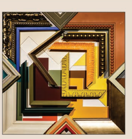
Gerry Dudgeon - Melplash Meadows

FRAME – PRINT – GALLERY Crewkerne and Beaminster