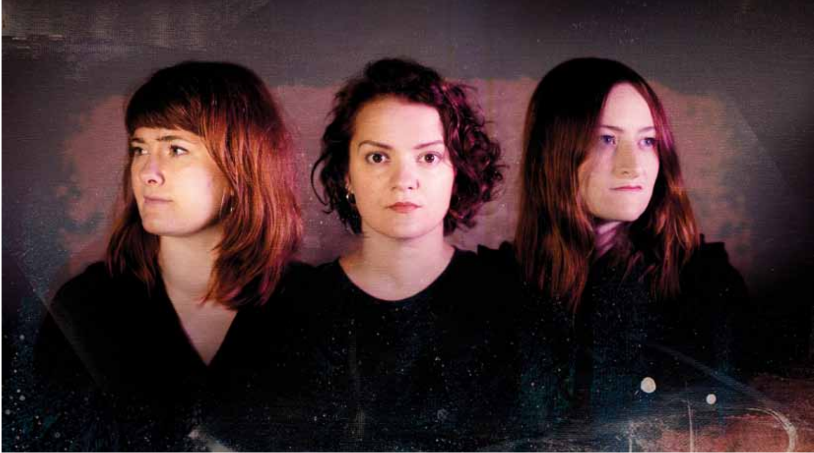
Lady Maisery come to Bridport in May

Individually multi award-winning artists, Lady Maisery have a unified voice, carrying stories of sisterhood, human struggle, the joy of living and the vitality of song with the “freshest possible take on traditional music” (Folk Radio UK). Their long-standing collaboration has been described as “adventurous and beautiful” (Mark Radcliffe, Radio 2) “exquisite and thrilling” (The Guardian) with “a generosity of spirit and joie de vivre that seems to emanate from every minute of their recorded output as well as from their exuberant live shows” (Folk Radio UK).