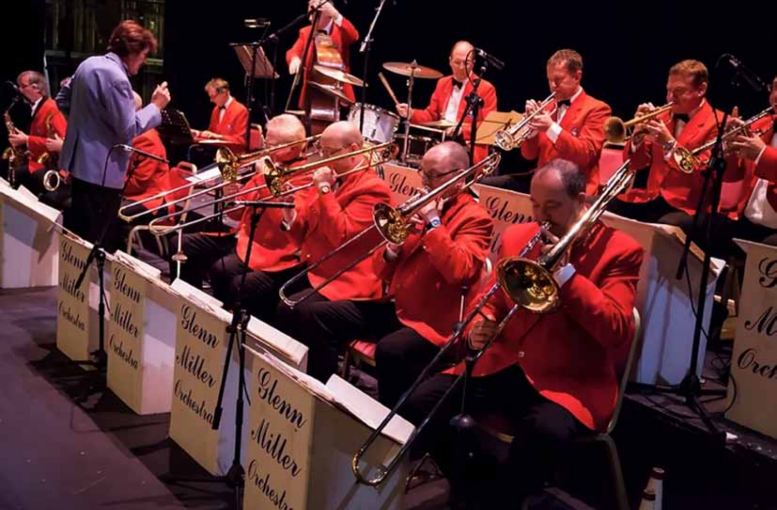
The Glenn Miller Orchestra

the BSO post in more than 60 years. He is expected to conduct five weeks in his first season, with this number increasing to nine weeks from 2025/26.