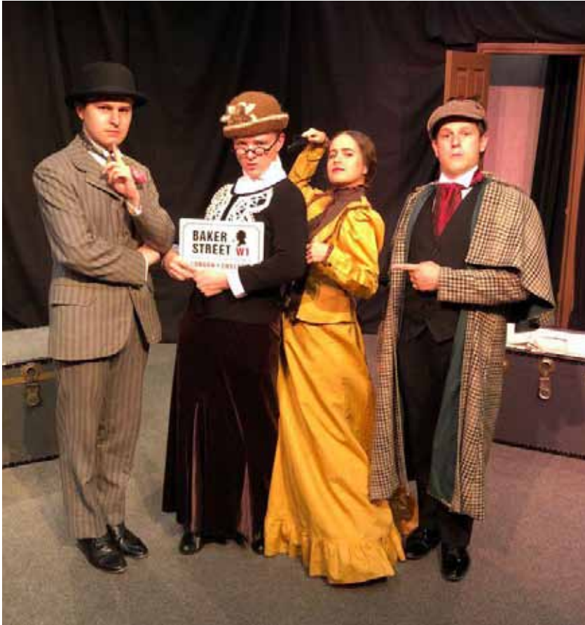
Sherlock's Excellent Adventure, a comedy adventure is touring in May

Vishnu descends to earth to save the world from its own excesses to restore peace and harmony. As the world becomes more aware of the troubles it faces, due to reckless human actions, the concepts in the show have great relevance to issues facing us all.